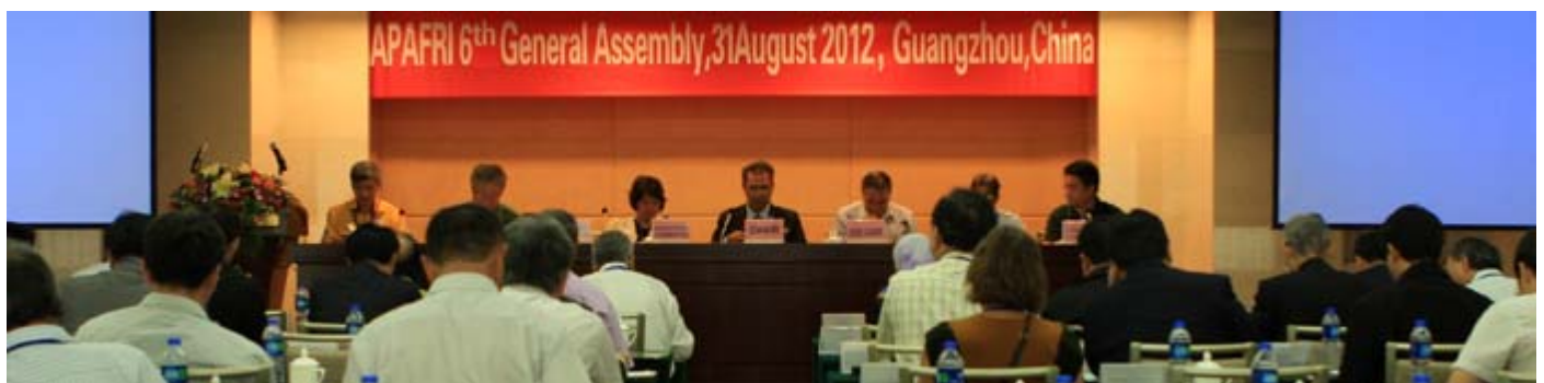
The Sixth General Assembly in Guangzhou, China